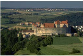
Garmin International, Olathe.