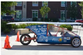
Technology at KSU: A golden opportunity for us!

At KSU, the teaching laboratories are the way to go for students in the whole spectrum of Mechanical Engineering. They enhance students' understanding of presented classroom material. These labs are equipped with the latest