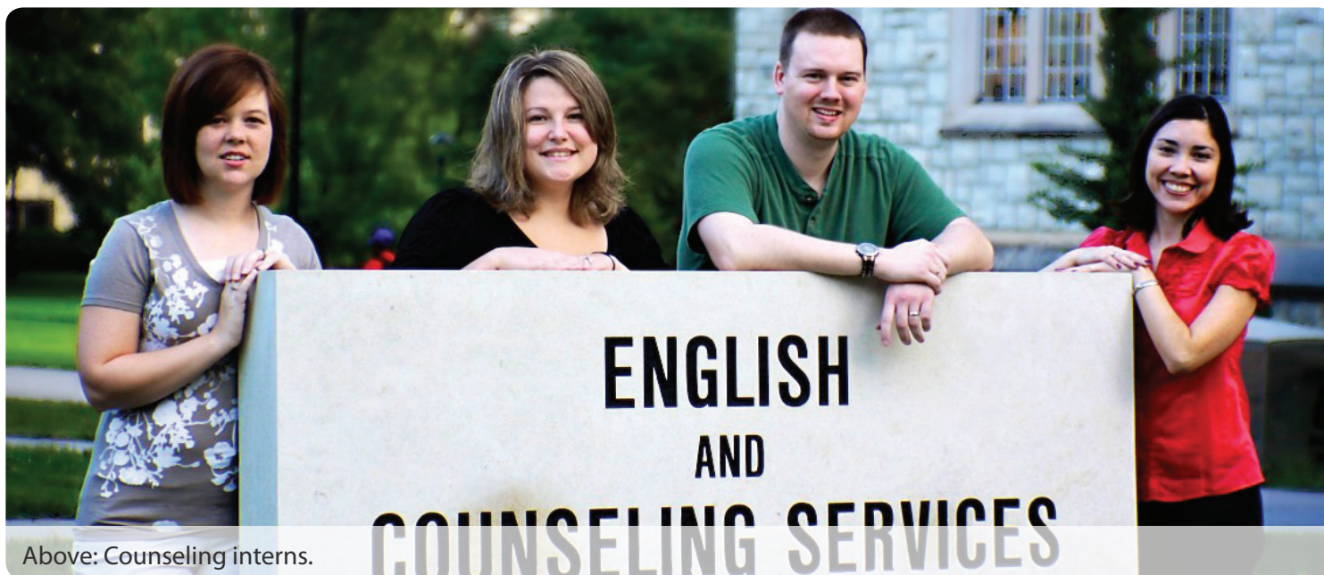
Above: Counseling interns.