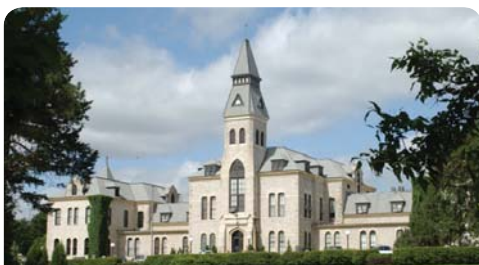
Learn More About Anderson Hall